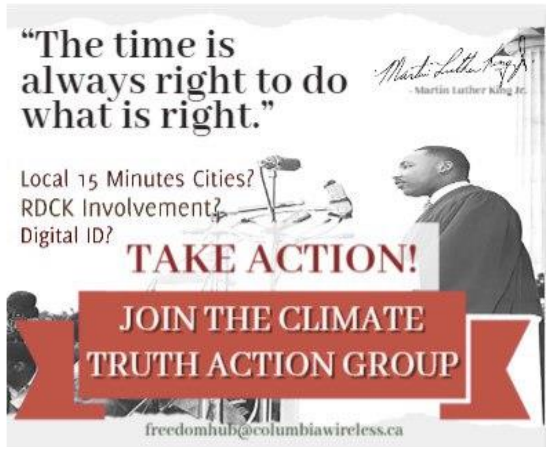
CALL TO ACTION!!! Please Spread to Your Groups

Climate Truth Action Group Goes Provincial - Takes Actions Against 15 Minute Cities and Digital ID's